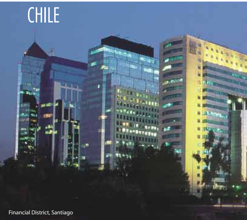
Financial District, Santiago