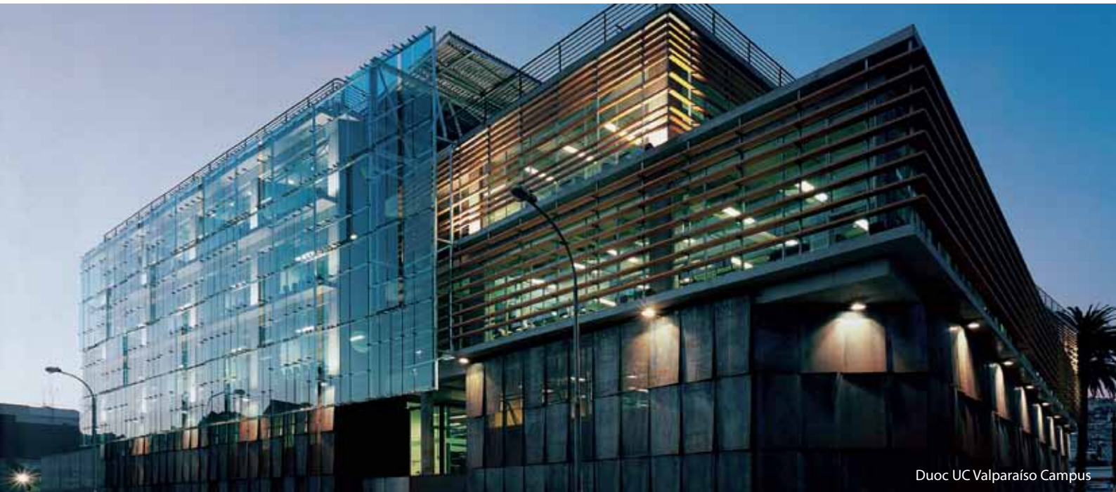
Duoc UC Valparaíso Campus