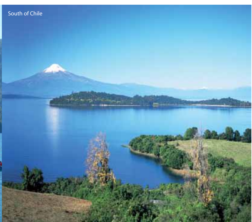
South of Chile