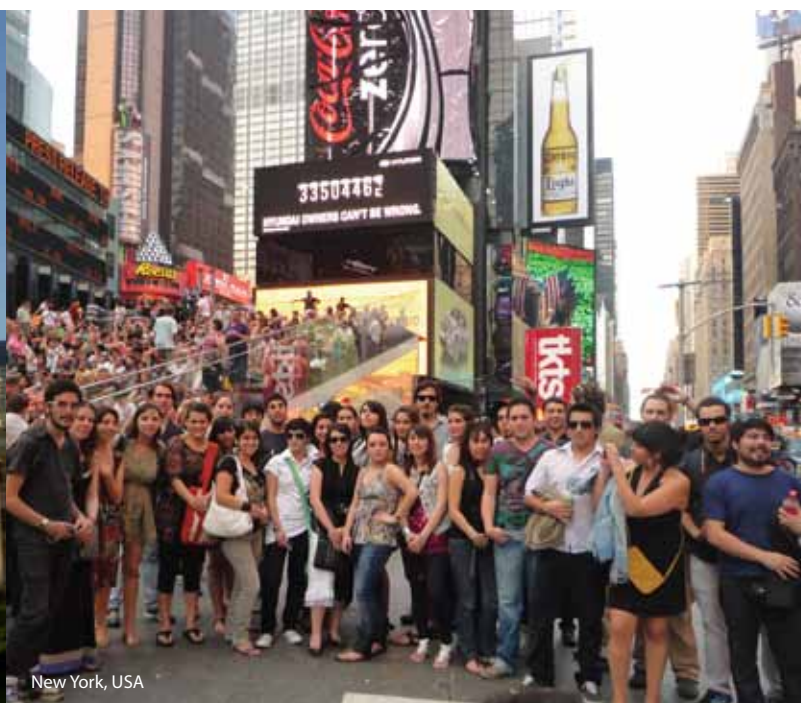
New York, USA