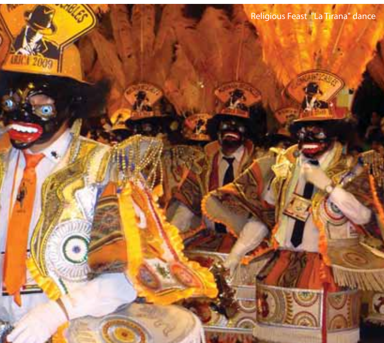
Religious Feast "La Tirana" dance