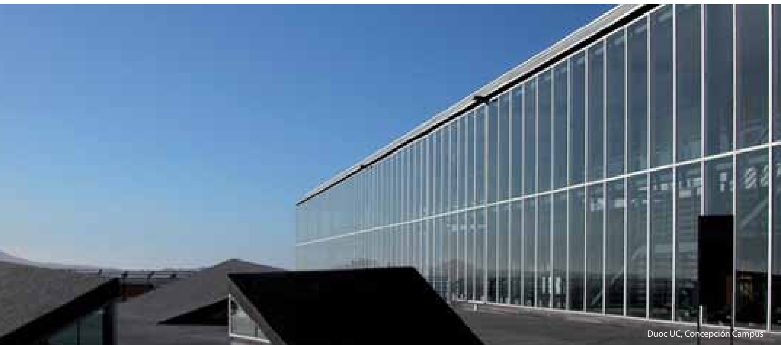
Duoc UC, Concepción Campus